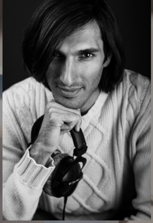
Audio Engineer, Musician, Producer

Every night after the toil and fuss of the day had come to