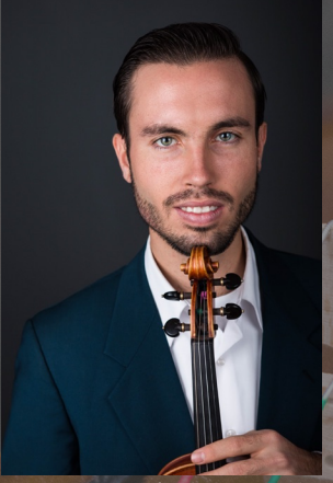
Composer, Violinist, Singer