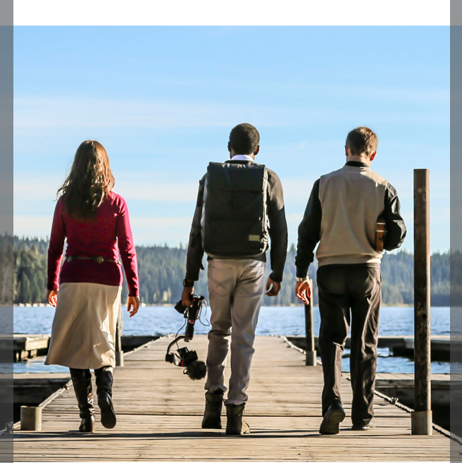
Photo: Lake Of The Woods, USA. Filming an episode for LUX series. To watch our videos visit: www.giveglory2him.org/videos

For Thou hast been a shelter for me, a strong tower from the enemy. I will trust in the covert of Thy wings. // When my heart is overwhelmed: lead me to the Rock that is higher, higher than I. [X 2]